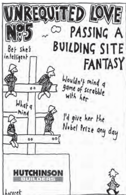
Deepest innermost thoughts of the Sensitive New Aged Guys found on all Hutchies' building sites.

Any enquiries are welcome to their accountant or bank manager who are available to answer any questions.