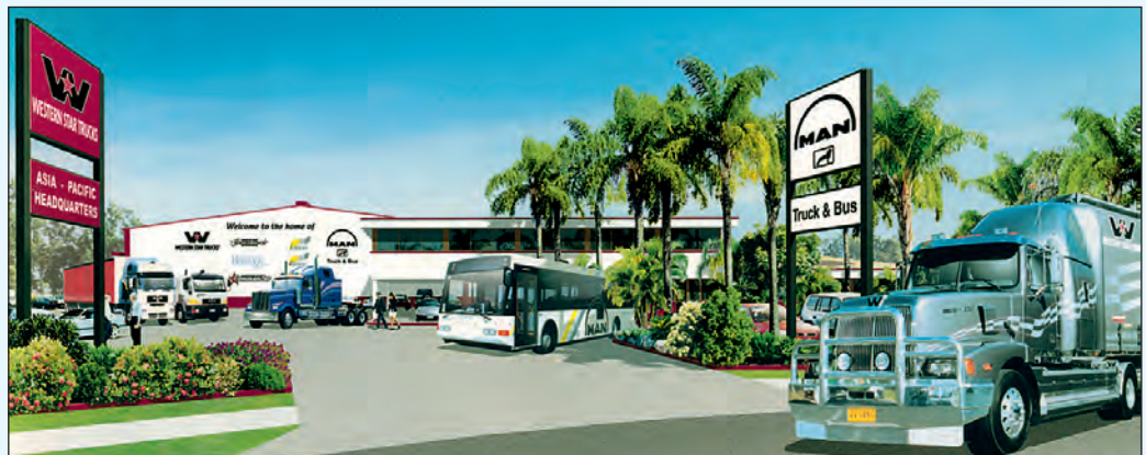
Artist's impression of the Western Star Trucks project.