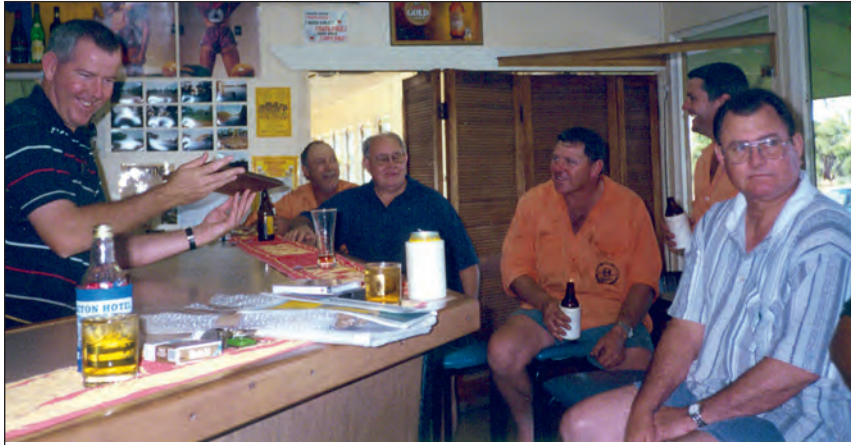
Hutchies' recently won QMBA award for the Min Min Light centre is shown off at the Boulia Golf Club. The delight and pride of the community was high as the trophy was handed around the bar.