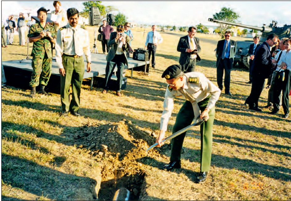
Australian and Singaporean dignitaries were on hand to celebrate turning of the sod for the storage facilities belonging to the Singapore Armed Forces.

THE island nation of Singapore has limited land available for development, which has resulted in the installation of overseas storage facilities for the Singapore Armed Forces near Rockhampton on the central coast of Queensland.