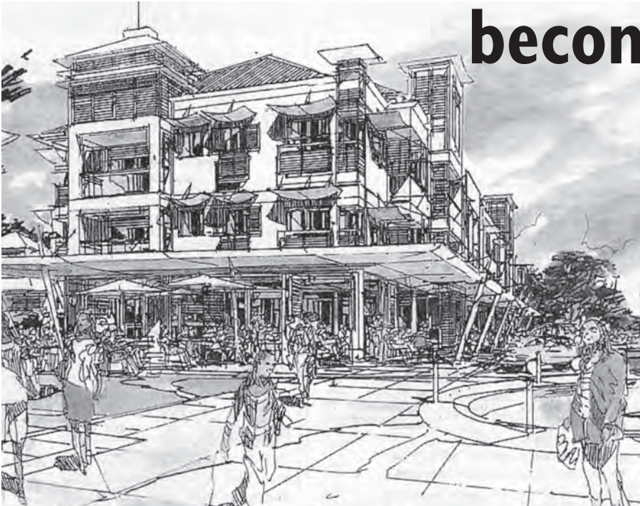
Artist's impression of Casuarina's Beachside Village with the "Australian beach house" architecture which will feature at the new development.

HUTCHIES' construction signs on beach-front land, 20 kms south of the New South Wales/Queensland border, signals that a 20 year dream is becoming a reality.